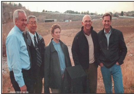
(Above Photo) City leaders dedicating the historic walking trail and park at Spencer's Pond.

The story of Cottonwood Heights' recreation and parks is one of remarkable community growth. From its early days, where local schoolyards served as central play areas for a scattered rural population, to the post-WWII boom that brought planned subdivisions,