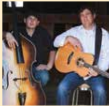
The Bad Larrys

Their signature sound features tight vocal harmonies with amusing and often off-beat storytelling. The Bad Larrys are a mix of genuine Americana music mixed with a touch of Prairie Home Companion. Their repertoire includes everything from Johnny Cash to Simon & Garfunkel, Lyle Lovett, Jerry Garcia, and even some countrified Aerosmith, Queen and Beyonce.