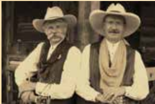
Emcees: Hired Guns

Noon Surf Daddy 12:45 p.m. Abbey Grove 2 p.m. Riverhouse Band 4 p.m. Phoenix Jazz & Swing Band 5:30 p.m. Joshua Creek 6:30 p.m. CH Arts Annie (Teaser) 7 p.m. The Bad Larrys 8:30 p.m. Dance Doctors