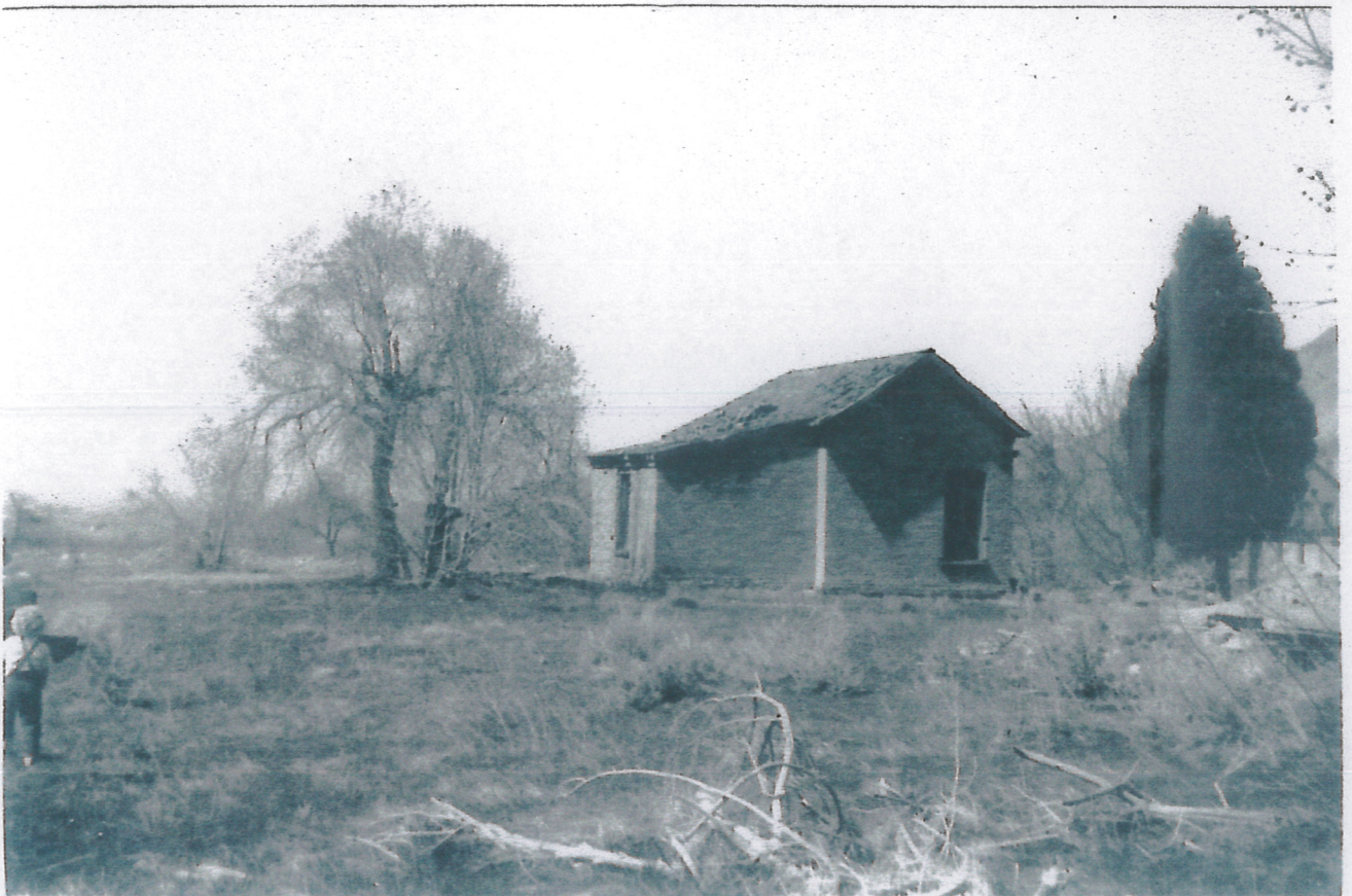
Paper Mill House