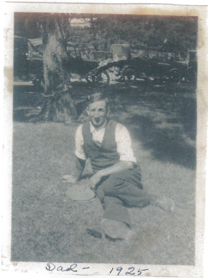
Dad - 1925