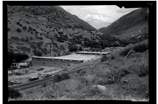
Picture of the 1957 water treatment plant in Big Cottonwood Canyon

The infrastructure built in the 20th century and the lessons learned in 1983 remain an