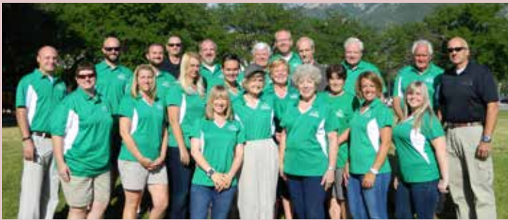
Butlerville Days Planning Committee