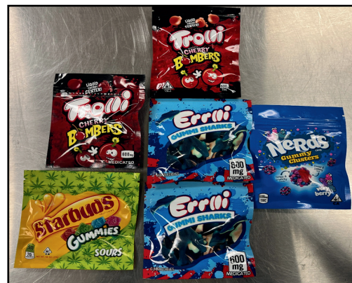
THC-infused edible products seized during the investigation were packaged to resemble popular candy, increasing the risk of accidental exposure to children.

The Cottonwood Heights Police Department encourages parents and caregivers to remain vigilant, to be aware of what items may be present in their homes,