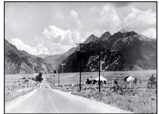
Looking east on 7000 South toward Big Cottonwood Canyon at approximately 2300 East. Circa 1950. The road would eventually be renamed Fort Union Boulevard.

Ft. Union Boulevard officially begins at 700 East and runs the breadth of