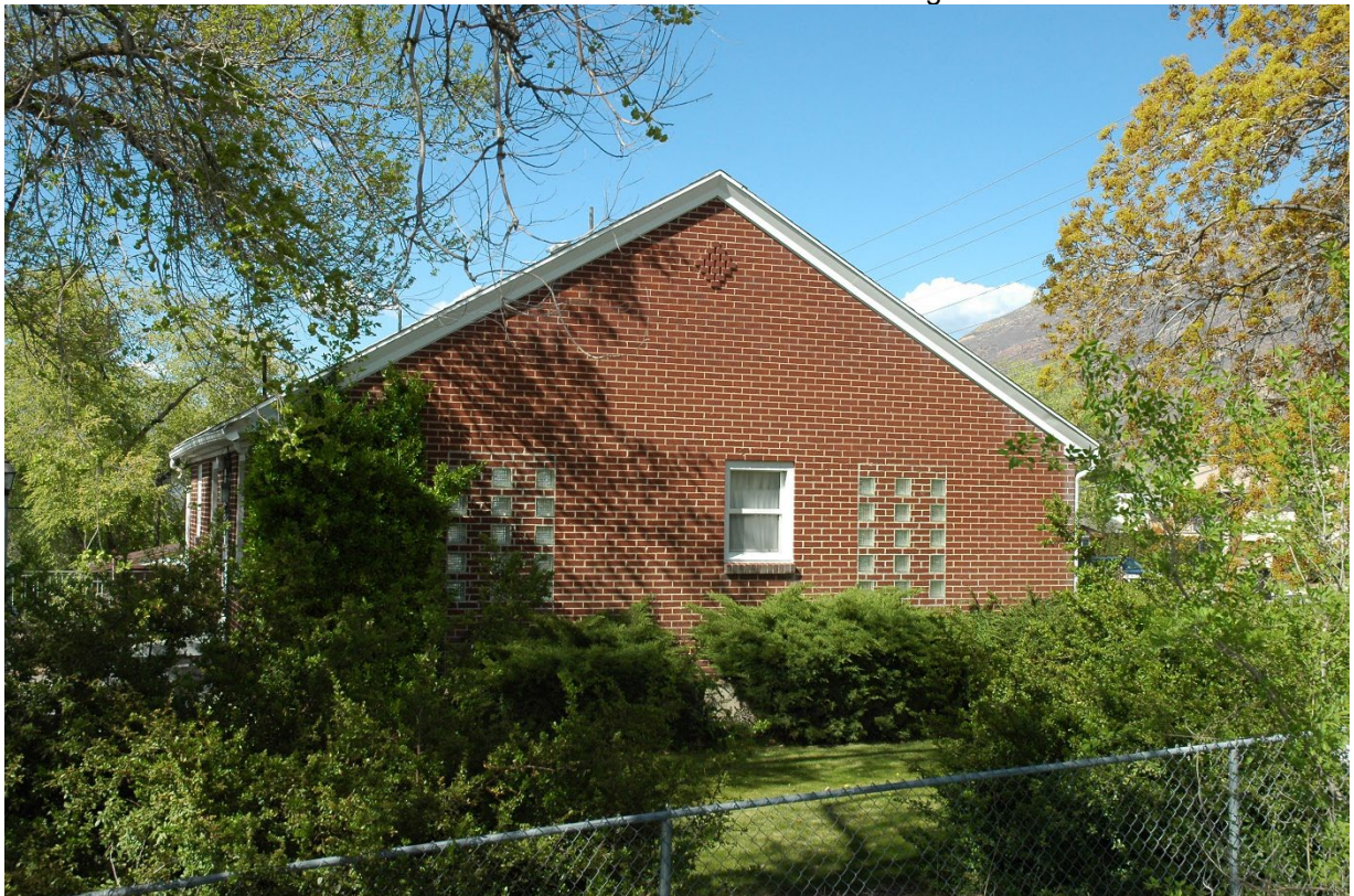
Photograph 4 South elevation of house. Camera facing north.