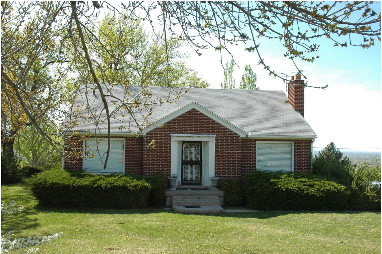
Photograph 1 East elevation of house. Camera facing west.