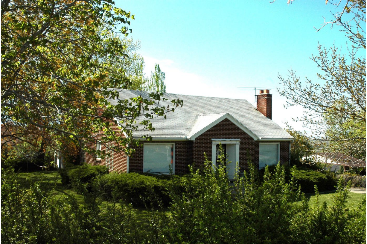
Photograph 3 East and south elevations of house. Camera facing northwest.