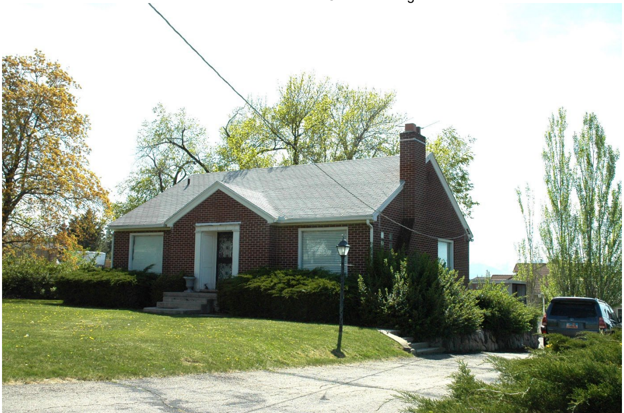
Photograph 2 East and north elevations of house. Camera facing southwest.